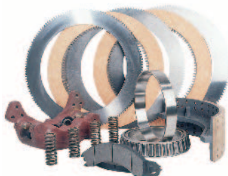
Brake parts and Wheel bearings