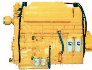
Fully Reconditioned Engines

EP Industries Ltd carry a large stock of new and used wheel rims, bands, flanges and lock rings which cover most sizes and fit most makes of equipment, such as: Cat, Terex, Volvo, Komatsu, etc