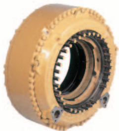
Wet type brake groups

Our commitment to providing quality guaranteed repairs continues so why not let EP Industries Ltd offer you a cost effective alternative