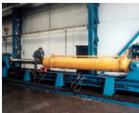
Demag 485 hydraulic cylinder disassembly