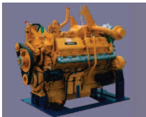
Fully reconditioned 'CATERPILLAR ENGINE'