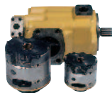
Vane type cartridges