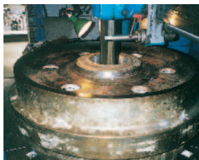
Reconditioning O & K RH200 front idler