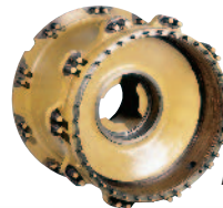
Rear wheel hubs